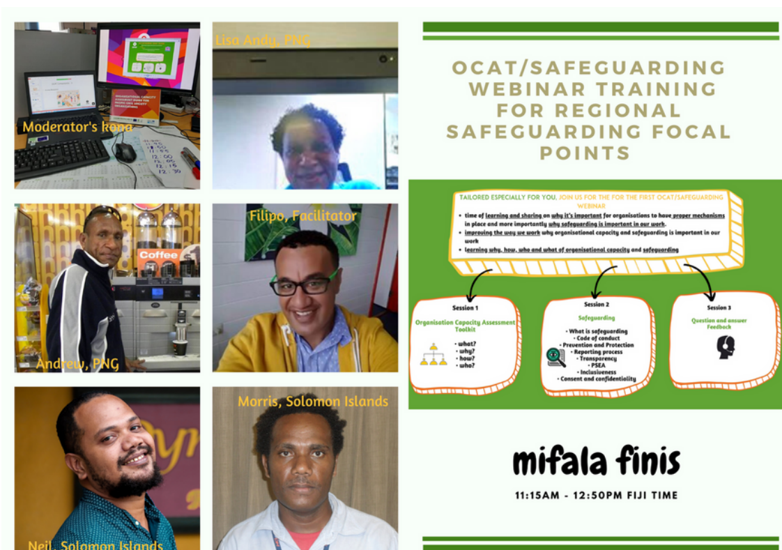
Regional safeguarding focal points pictured after a successful launch of OIP's inaugural Safeguarding seminar via webinar and OIP staff participants in the pic below.