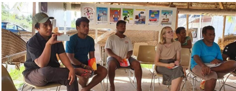
KIRICAN members discussing organisational capacity strengths and weaknesses.