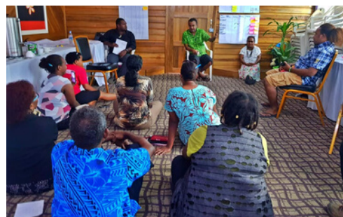
DSE member partners participating in discussions on influencing strategies, planning and mapping

The focal points of member organisations of Solomon Islands civil society umbrella body Development Services Exchange (DSE) underwent a four-day learning and strategising training on how to collectively plan and lobby to influence an issue with local and national decision-makers that contributes to achieving the mission of DSE.