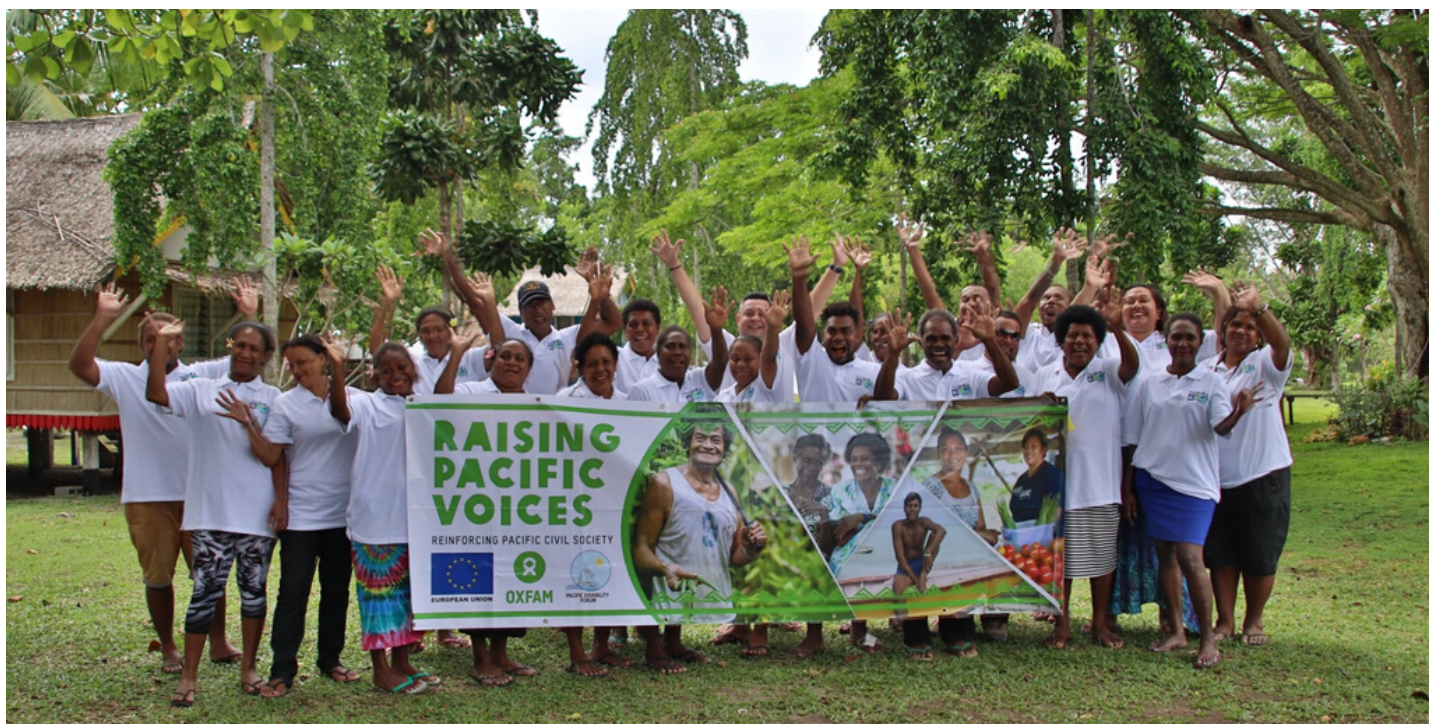
DSE member organisations after a successful OCAT and ICAT week long conversation in Kaptain's point, Honiara, Solomon Islands.