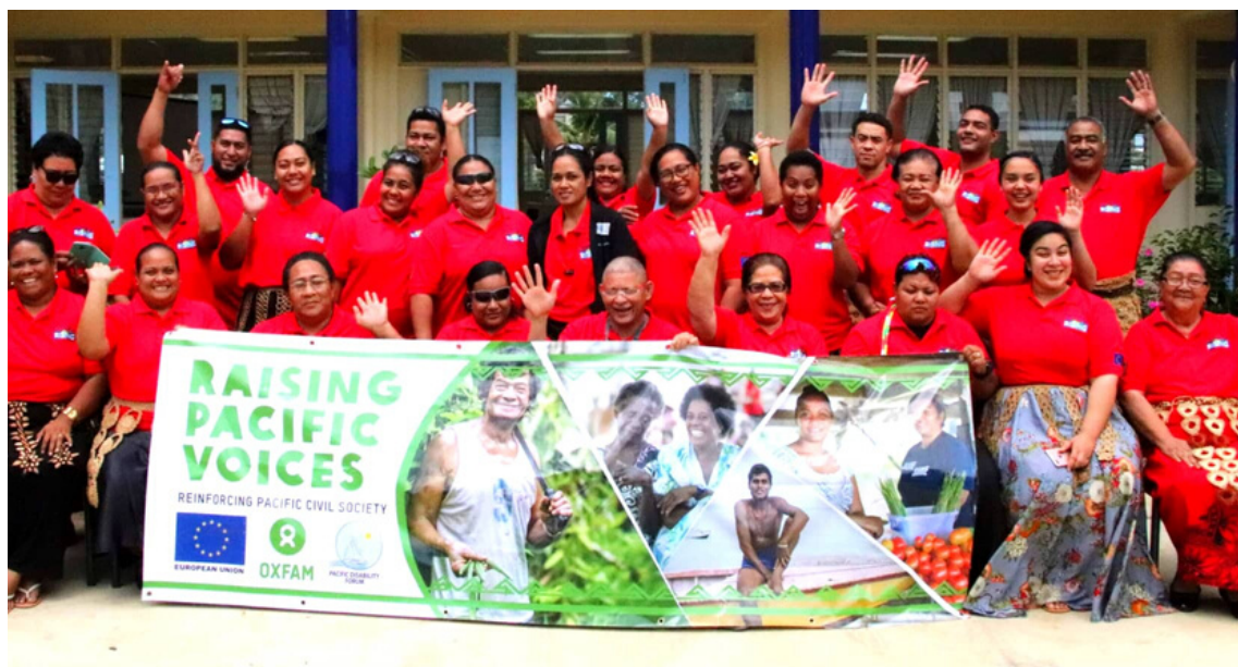
Participants from the 5 Tongan CSO's that participated in the Humanitaria and OCAT workshop in Nukualofa in October, 2019