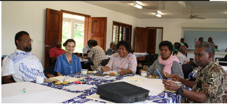
Vatu Mauri Consortium members in Port Vila, Vanuatu participate in discussions on strategic and organizational planning and legislative review.

Capacity development program to strengthen capacity of selected national level CSOs to effectively represent constituency voice in relevant local & national level governance spaces developed, tested & implemented in Melanesia, Polynesia & Micronesia sub-regions.