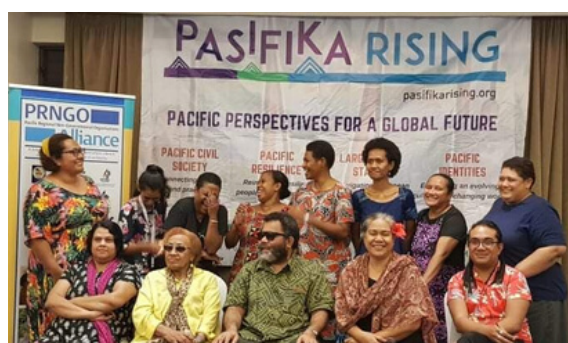
PRNGO Alliance representatives (PDF, PIANGO, PACFAW, WWF Pacific, PYC, PCC, PCP) take a group picture with Oxfam in the Pacific and RPV support team.

https://www.pasifikarising.org/wp-content/uploads/2019/09/Navigating-Social-Change_FINAL_web_250919.pdf