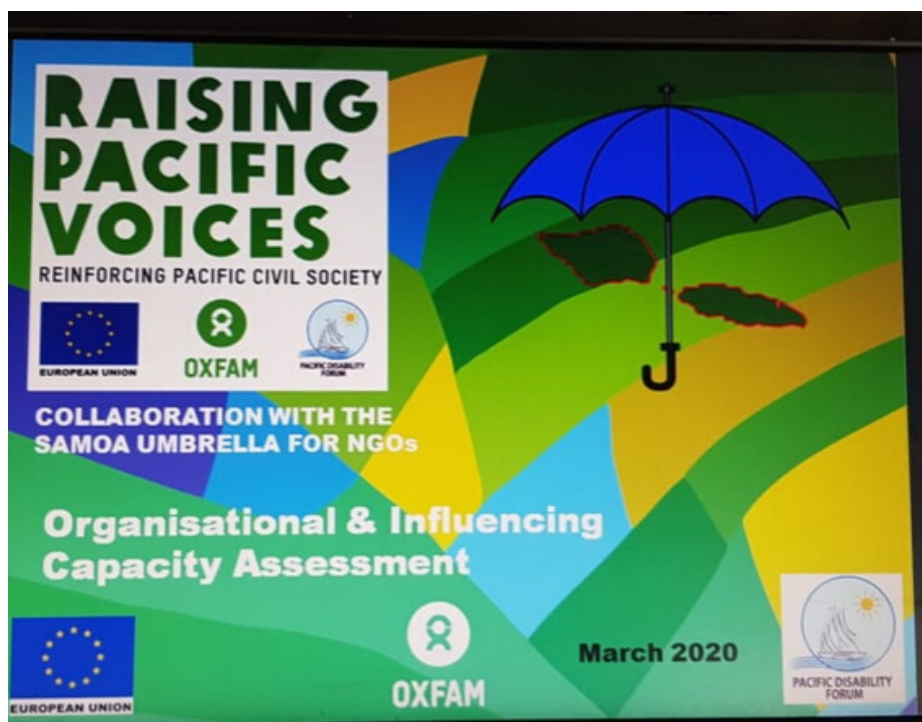
Organisational Capacity Assessment Training with SUNGO held in March, 2020

Capacity development program to strengthen governance & transparency of national CSOs, developed, tested & implemented in Melanesia, Polynesia & Micronesia sub-regions (Vanuatu, Tonga & Marshall Islands)