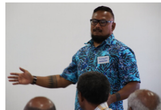
RPV Team Leader emphasizing the need for organisations to have working governance systems in place or accountability and transparency in its constituents.

In July 2019, RPV's Vanuatu CSO partner – Vatu Mauri Consortium convened a "Regional Self Determination Dialogue", with funding support from the project, in Port Vila. Different self-determination groups represented at the dialogue included representatives/activists for: the Kanaky movement; West Papua self-determination; Maohi Nui and Bougainville self-determination;. The full membership of the Mal Vatu Mauri Council of Chiefs were represented, along with members of the Vatu Mauri Consortium (i.e. Vanuatu National Youth Council; Vanuatu National Council of Women; Vanuatu Human Rights; and Vanuatu Christian Council), and representatives of VANGO. The Ministry of Foreign Affairs and Special envoy to PIFS for Vanuatu also presented at the dialogue.