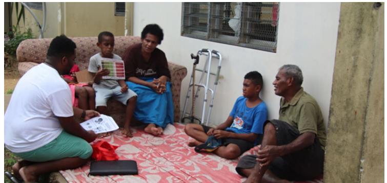
FCOSS representatives pictured at the CSO briefing for Covid 19 before going into community outreach and awareness to their communities.

To help communities prepare themselves for the COVID19 pandemic, the RPV program collaborated with the CSO and NGO community in Fiji. Partnering with communities who work closely with communities, RPV partnered with Fiji Council of Social Services (FCOSS) and Rise Beyond the Reef and assisted with the printing of public health messaging materials to be distributed through the communities that they serve. Materials were also translated into itaukei and hindi languages.