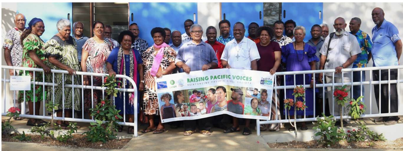
Representatives of Vanuatu Christian Council as a member of the Vatu Mauri Consortium of organisations in October 2019 participated in a dialogue to build their capacity to influence policy at a national level.