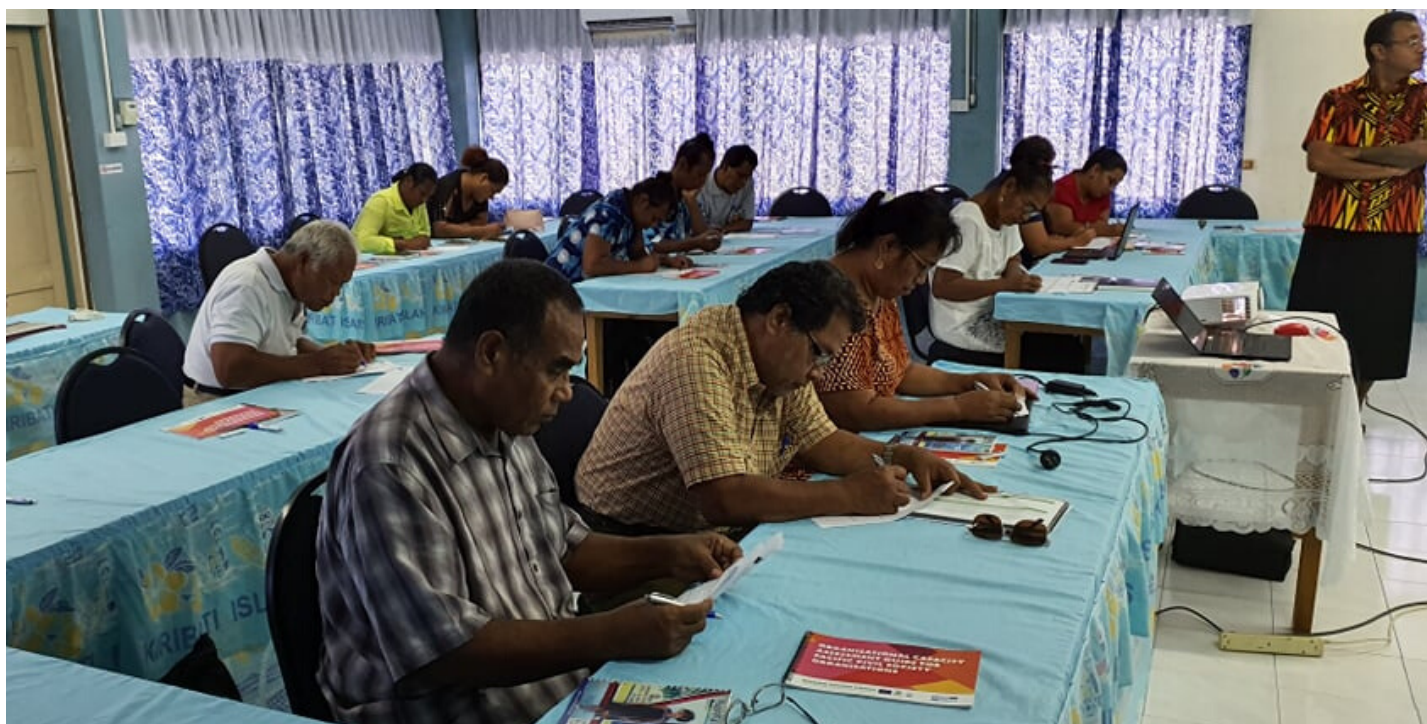
KANGO members undergoing safeguarding policy assessment in Kiribati.