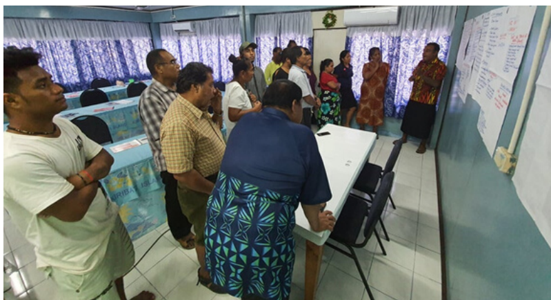
Representatives from Kiribati Association Non-Governmental Organisation (KANGO) undergoing group activity reviewing existing organisational governance structures.

Raising Pacific Voices (RPV) project commenced trainings for four key non-government organisations and civil society groups in Kiribati in early March of 2020.